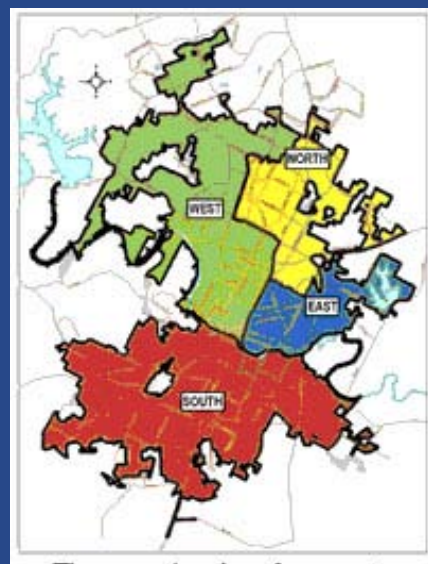
There are 4 code enforcement districts in Austin.